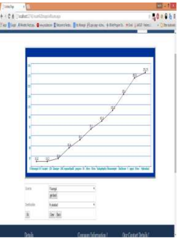
Figure 1. Detailed travelling information for user under category 1.

User under Category 2 submits the query and obtains only the information at very high abstract level. In the figure 2 below it is observed that only 3 location details out of 11 locations are shown.